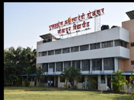
P.A.H. Solapur University, Solapur

Solapur district is the fourth largest district of Maharashtra. Solapur district has its own importance since it is the only place in India, that enjoyed the freedom even before independence during 9th to 11th May 1930. Solapur Municipal Council is the first Municipal Council of India to hoist the National flag on Municipal Council building in the year 1930. It consists of 11 taluka places with famous religious places like Pandharpur and Akkalkot. It was known as Textile Capital or Labour City in Olden days. At present, it is a transport hub connecting Maharashtra, Karnataka and Andhra Pradesh. "Solapuri chadars" are famous and is one of the first product in Maharashtra to get a Geographical Indication tag.